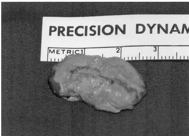
Fig. 2 The 2×2×0.5-cm calcified mass that was detected in the right fossa ovarica

and 19 cases were reported. There are two possible aetiologies. The first involves an asymptomatic torsion of one or both adnexa during adult life or childhood, or even before birth [4]. Alternatively, the absence may be congenital, due to either a defect in the development of the entire müllerian and mesonephric systems on one side, or to a defect localized to the region of the genital ridge and the caudal part of the müllerian duct [2]. Partial or total unilateral defects of a paramesonephric duct are more common than aplasia of both ducts [5]. However, because of the close embryologic association between the genital and urinary tracts, one would expect to find a unicornuate uterus and one ectopic or