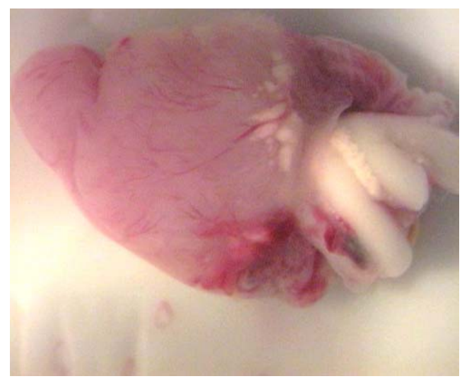
Fig. 4 Pathological specimen of a chick embryo showing some minor degree of structural damage after transamniotic intracardiac access 3 days prior to hatching