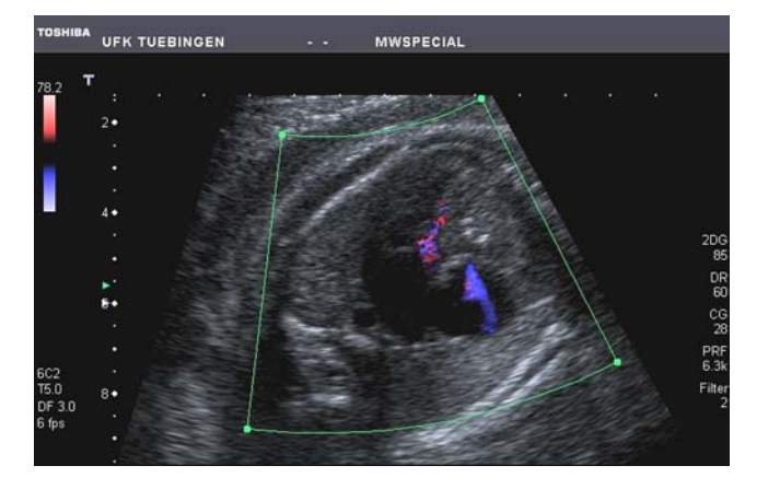
Fig. 2 In the color-flow map imaged for the same fetus as in Fig. 1, a blue jet of tricuspid regurgitation can be visualized