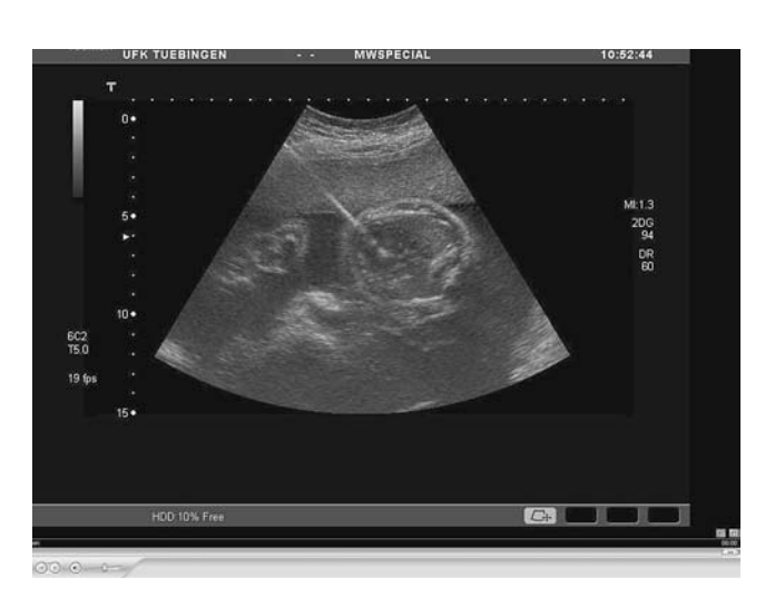
Fig. 3 Transuterine intraventricular needle entry in a fetus at 24 weeks' gestation with critical aortic stenosis

In-utero balloon valvuloplasty has been performed as a means of improving the perinatal condition of affected infants [26, 28, 33, 44, 50, 51]. Postnatal balloon aortic valvuloplasty is a widely accepted treatment modality and represents the procedure of choice in many units for children of all ages with congenital valvular aortic stenosis [53, 56–59]. The growing fetus who would subsequently require a postnatal balloon aortic valvuloplasty presents a challenge to the pediatric cardiologist or cardiac surgeon to provide an early treatment that ideally will allow compensatory growth even before birth. The current inability to securely demonstrate a benefit of