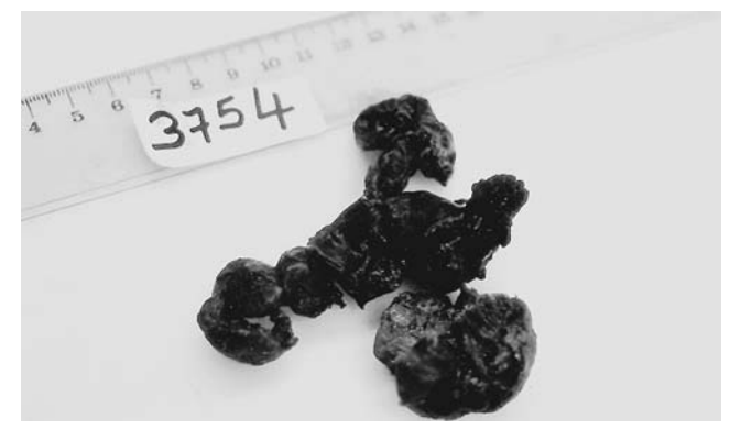
Fig. 3 The hemorrhagic, necrotic fallopian tube with the right overv

The diagnosis of isolated fallopian tube torsion is often not a clinical one, but, as in our case, is made during