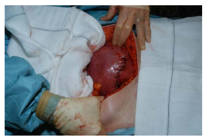
Fig. 8 Gravid uterus is replaced in the pelvic cavity