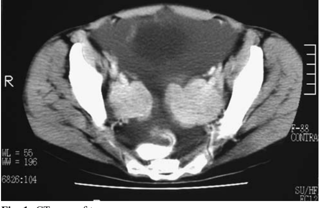
Fig. 1 CT scan of tumors

normal range. Paracentesis revealed an exudate without evidence of malignancy or infection. A CT scan showed both tumors (Fig. 1), the walled up ascites (Fig. 2), and also showed peritoneal and small bowel thickening, more evident in the greater omentum. All these findings suggested the diagnosis of ovarian cancer. A laparotomy was performed.