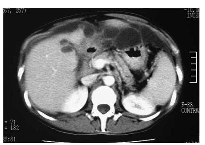
Fig. 2 CT scan showing walled up ascites

At laparotomy, 900 millilitres of yellowish watery ascitic fluid was found in the peritoneal cavity. Examination of the ovaries revealed multinodular and firm ovarian tumors of 75 \times 35 \times 30 mm in the right ovary, and 110 \times 55 \times 45 mm in the left ovary (Fig. 3). Diffuse fibrosis of the mesentery and the small bowel serosa and omental thickening were also found. The walled up peritoneal and omental fibrosis in the upper hemiabdomen did not let the surgeon explore the liver nor the stomach. Bilateral oophorectomy and an omental biopsy were performed. The sectioned surfaces of the tumors were whitish, solid and homogeneous (Fig. 4). Microscopically, the ovarian lesions were a mixture of cellular and edematous zones. The cellular zones consisted of densely packed fascicles of fibroblasts with nests of luteinized cells (Fig. 5). Mitoses were abundant between