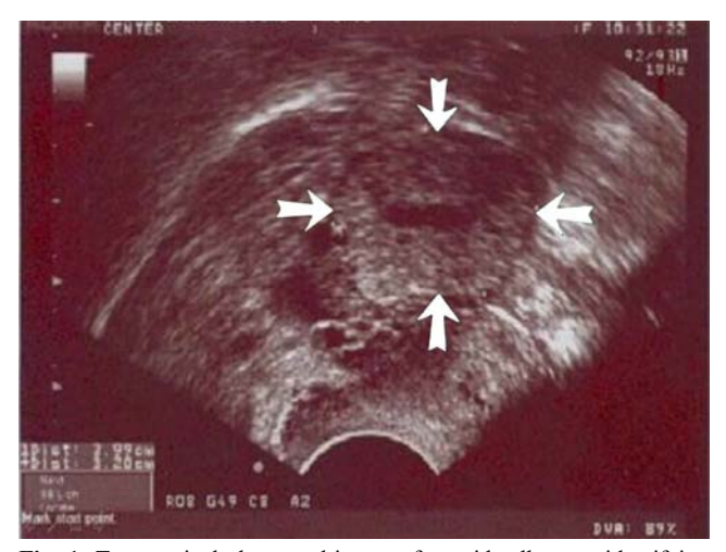
Fig. 1 Transvaginal ultrasound image of steroid cell tumor identifying a well-circumscribed, lobulated, solid, right ovarian tumor ( arrows ), 4.0×3.2 cm in diameter

Scully initiated the term "steroid cell tumor of the ovary" in 1979. These tumors were previously classified as lipid or lipoid cell tumors. Lipoid cell tumors are believed to arise in adrenal cortical rests that reside in the vicinity of the ovary. More than 100 cases have been reported, and bilateral disease has been noted in only a few. The early nomenclatures were misleading because some tumors have little or no lipid present. The term "steroid cell tumor" more accurately