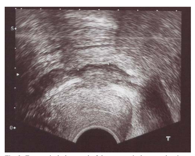
Fig. 2 Transvaginal ultrasound of the rectovaginal space, showing a hypoechogenic structure with a hyperechogenic halo distorting the hypo- and hyperechogenic layer of the anterior rectal wall, thereby, suggesting infiltration of the rectal muscularis

A 26-year old (gravida 0 para 0) female of Caucasian origin presented with a long-standing history of dysmenorrhea, pelvic pain, dyspareunia, severe dyschezia and primary subfertility at our department. In addition, haematuria and dysuria with intermittent episodes of frequency had developed within the past 3 months. Her medical history did not reveal any abnormalities and she was treated for common menstrual pain with non-steroidal antirheumatics and opioids over the recent few years. At presentation in