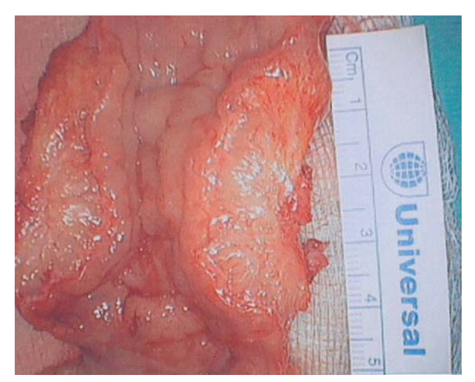
Fig. 4 Rectum with luminal obstruction caused by endometriotic infiltration of the anterior rectal wall

A transvaginal ultrasound scan of her pelvis finally revealed a 3.7 \times 4 \times 3 cm hyperechogenic, round-shaped mass originating from the posterior wall of the urinary bladder, protruding into the bladder cavity (Fig. 1). In addition, a 3 \times 1.3 \times 2 cm hypoechogenic mass with a hyperechogenic halo was located in the upper third of the RVS, distorting the hypo- and hyperechogenic layer of the