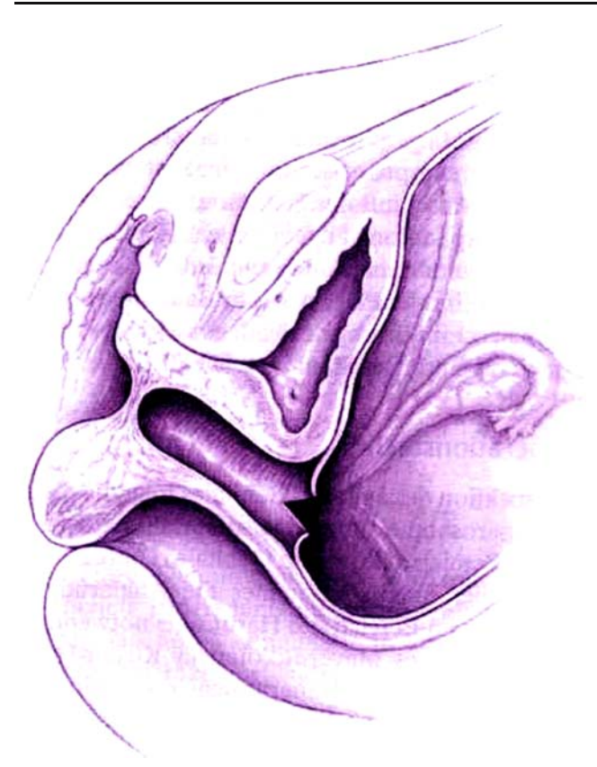
Fig. 1 After instillation of a vasoconstrictive agent, the vesico-rectal septum is dissected with monopolar scissors down to a pseudohymenal membrane under constant visualization of the bladder and the rectum

topical instillation of oestrogenic cream for at least 3 months until onset of regular sexual intercourse.