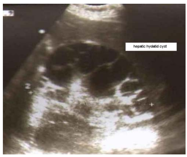
Fig. 2 Sonograpy of hepatic hydatid cyst at fifth and sixth segments

Cysts recurring after surgery or cysts that do not demonstrate regression after chemotherapy may be treated