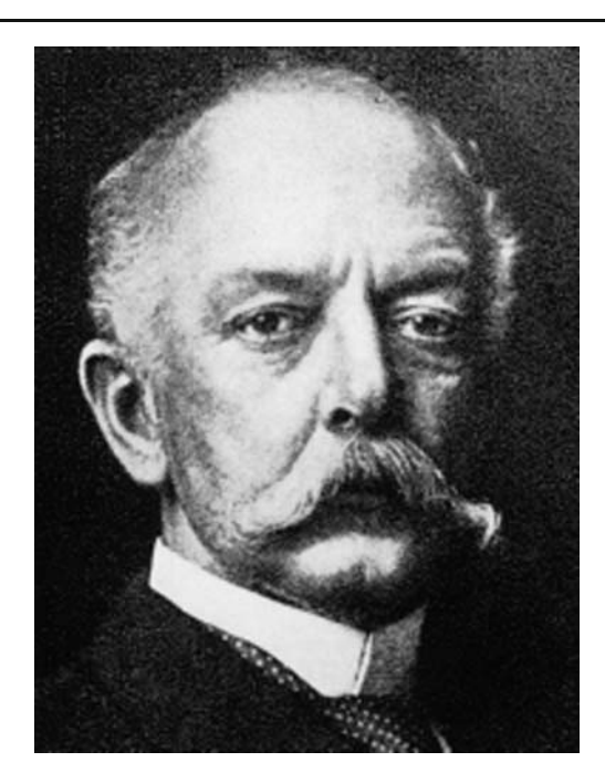
Fig. 1 Charles McBurney

In actual medical practice, the application of Fitz's message ran into two obstacles: (a) the (family) doctors, the first to be consulted by the patients, had to correctly diagnose the affliction, and (b) they had to be convinced that Fitz, a pathologist-anatomist, was right in his assumptions.