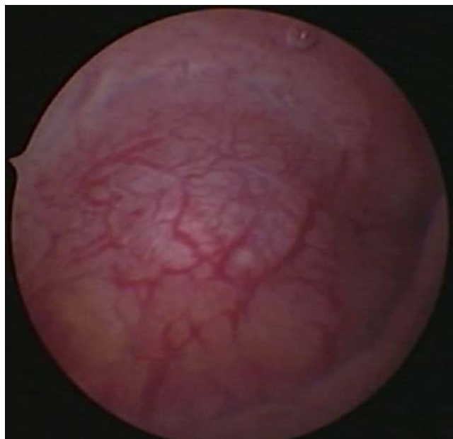
Fig. 1 Submucous fibroid near from tubal ostia

A 27-year-old, single, white, nuliparous woman came to our private service (Ginendo-RJ) with the diagnosis of uterine fibroid. She complained of heavy menstrual bleeding,