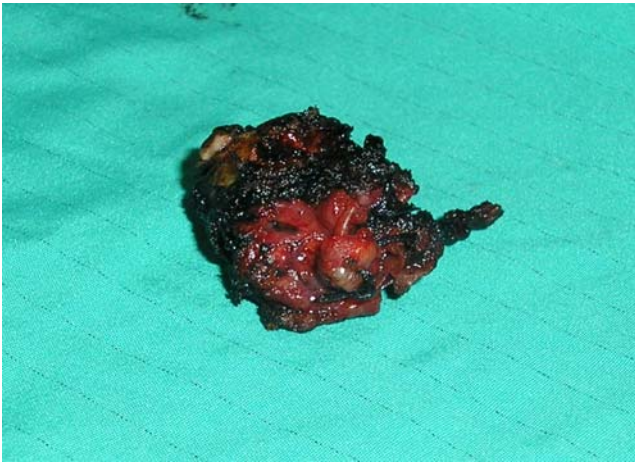
Fig. 3 Ectopic pregnancy excised using a monopolar needle

implant, the gestational sac is located between cervix, distally, and the decidualized functional endometrium, cranially [10]. A weakness of the cervical canal plays a role in the pathogenesis of cervico-isthmic pregnancy [10].