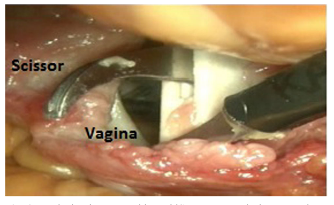
Fig. 3 Vaginal colpotomy with MobiSep prototype in human cadaver test

device. The importance of a uterine manipulator during LH has been demonstrated in literature. A manipulator is considered to increase the distance between the ureter and uterine arteries, thereby creating more space for the dissection of the uterine arteries [29]. Furthermore, in a recent Delphi study, full agreement was reached regarding the use of a uterine manipulator during LH to prevent ureter injuries during LH [30]. This resulted in the final design of the prototype: a uterine manipulator with an integrated vaginal colpotomizer.